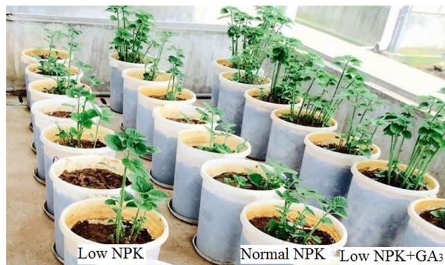
Figure 3. Growing ramie in a greenhouse under different fertilizer conditions: low NPK (N:P:K at 140:70:140 kg ha -1 ), normal NPK (N:P:K at 280:140:280 kg ha -1 ), and low NPK + GA 3 (gibberellic acid; 10 mg L -1 ).

NPK fertilizer and exogenous application of GA 3 . The prepared pots were separated into low NPK, normal NPK and low NPK + GA 3 treatment groups (Fig. 3). Each of the three treatment groups was further subdivided into K, P, PK, N, NK, NP, and NPK treatments. In the low NPK groups, fertilizer concentrations were 140, 70, and 140 kg ha -1 for N, P, and K respectively. In the normal NPK group, fertilizer concentrations were 280, 140, and 280 kg ha -1 for N, P, and K, respectively. Controls received no fertilizer. P was applied as a single dose in the form of calcium super phosphate (14% P 2 O 5 ) at planting. N, in the form of urea (46% N), and K, in the form of potassium chloride (54% K 2 O), were applied in three doses: at planting (40%), in June (30%) after the first harvest, and in August (30%) after the second harvest. For the NPK + GA 3 treatment group (n = 28), 10 mg L -1 GA 3 was sprayed over the canopy three times. The first dose (50%) was sprayed in April (10 days after planting), and subsequent doses were sprayed 10 days after each harvest, with 30% sprayed in June and 20% sprayed in August. Each treatment was replicated four times, arranged in a randomized complete block design.